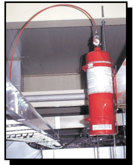
Image 5 - Firetrace DLP System.

FIRETRACE® AUTOMATIC FIRE SUPPRESSION SYSTEMS