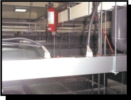
Image 1 - Elevated Cable Trays

Elevated cable trays crisscross above the floors of thousands of factories and manufacturing facilities around the world ( see Image 1 ). Some may carry electrical lines while others carry voice or data line. These cable trays pose an interesting situation when it comes to fire protection: How do you protect open cable trays that are anywhere from 10 to 40 feet above the ground? Firetrace now provides an excellent, cost-effective solution to this application.