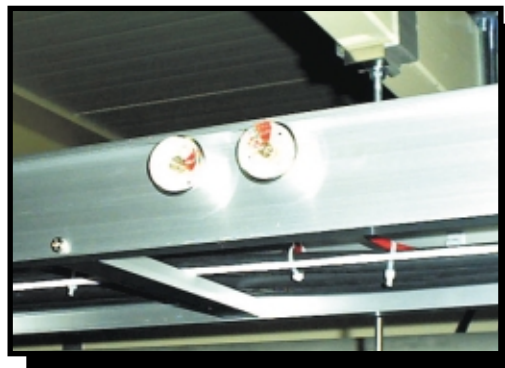
Image 4 - Firetrace Pressure Gauges

The electronics manufacturer was very pleased with the project costs, installation time and system configuration. They anticipate adding this same Firetrace protection to three of their other facilities.